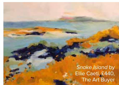
Snake Island by Ellie Caeti, £440, The Art Buyer