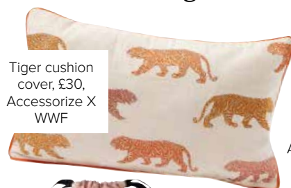
Tiger cushion cover, £30, Accessorize X WWF

Looking for a tiger in the bedroom? Is it time to address that elephant in the room... Terrible jokes aside, that's what the new collab between Accessorize and WWF is bringing to the home. Hand-embellished cushion covers, make-up bags and slippers are adorned with the world's most loved animals. The collection has a focus on materials such as natural silks, organic cottons and Oeko-Tex fabrics, and a contribution will be made to WWF's global work helping to protect and restore the planet.