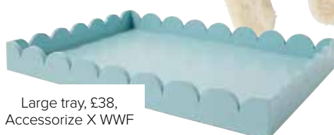
Large tray, £38, Accessorize X WWF