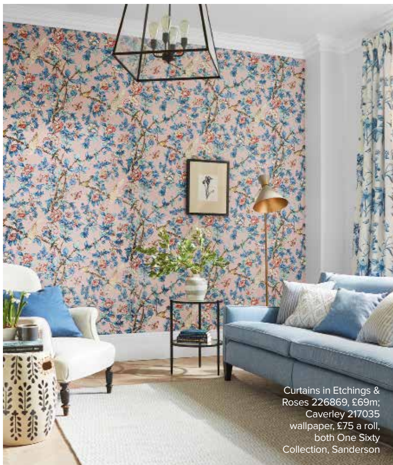
Curtains in Etchings & Roses 226869, £69m; Caverley 217035 wallpaper, £75 a roll, both One Sixty Collection, Sanderson