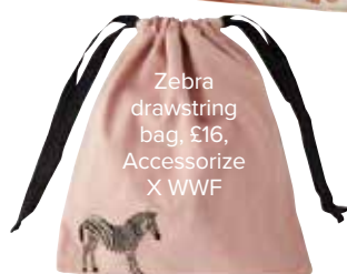
Zebra drawstring bag, £16, Accessorize X WWF